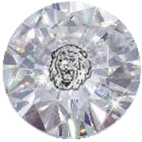
Illustration of the Truth

Abraham bearing the mark of circumcision